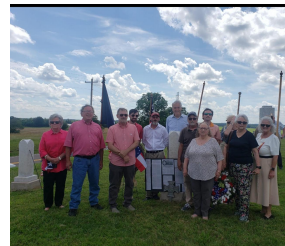
Some of his 4th, 5th, and 6th generation descendents