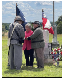
Presentation of the flag